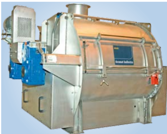
Blade mixer with synchronized shafts