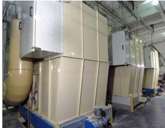
Counter air-flow dryers-coolers

Our thermal treatment line mainly includes 2 machines :