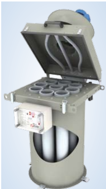
Decompression sleeve filter

From a compact pads filter designed for bags unloading to the high capacity sleeve filter used for centralised cleaning, Desmet Ballestra Stolz can offer you solutions to your filtering needs.