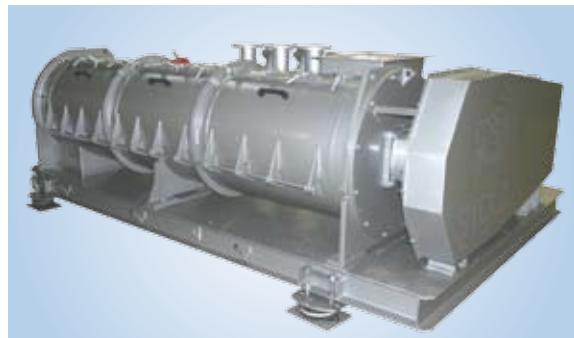
Stainless steel molasses mixer