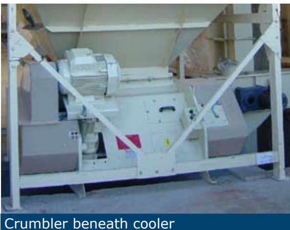
Crumbler beneath cooler