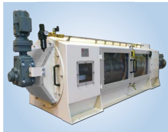
BCMT 750 Turbosifter