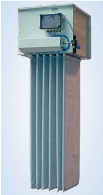
Built-in pad filter