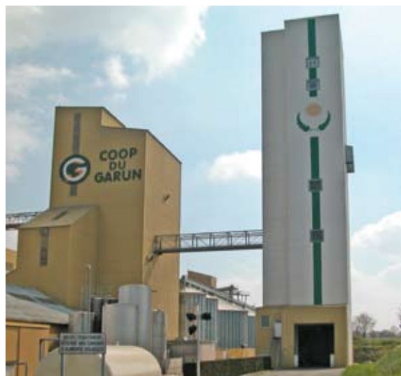
Insulated thermal treatment tower to limit contamination risks

Get more details on the web www.desmetballestra.com