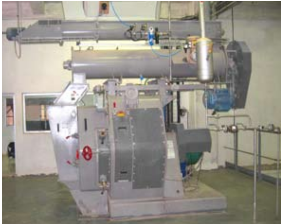
LYDER pellet mill with conditioner

The high reliability pellet mills designed by Desmet Ballestra Stolz are especially optimized for the animal feed and aquafeed industries.