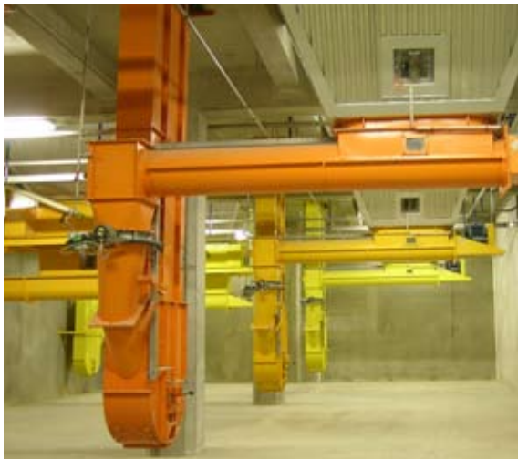
Elevator foot above ground with optimized discharge