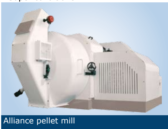
Alliance pellet mill

Get more details on the web www.desmetballestra.com