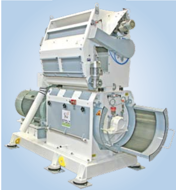
RMP 18 hammermill and ABMS 8

Get more details on the web www.desmetballestra.com