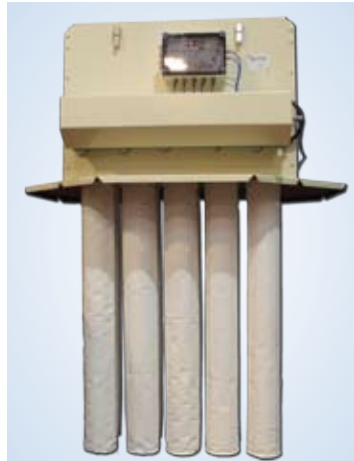
Sleeve filter unit for pneumatic transfer

From a compact pads filter designed for bags unloading to the high capacity sleeve filter used for centralised cleaning, Desmet Ballestra Stolz can offer you solutions to your filtering needs.