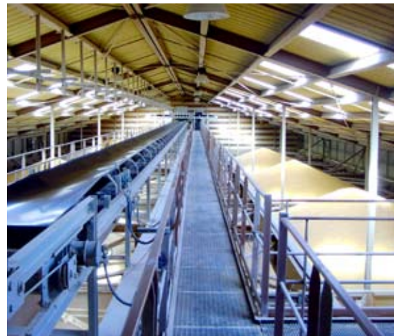
Storage bins feeding by belt conveyor