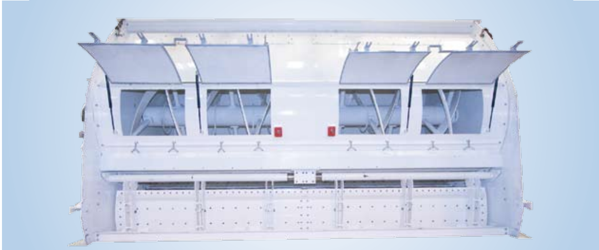
Ribbon mixer with fully opened bottom

Mixing solutions designed by Desmet Ballestra Stolz meet a wide range of requirements.