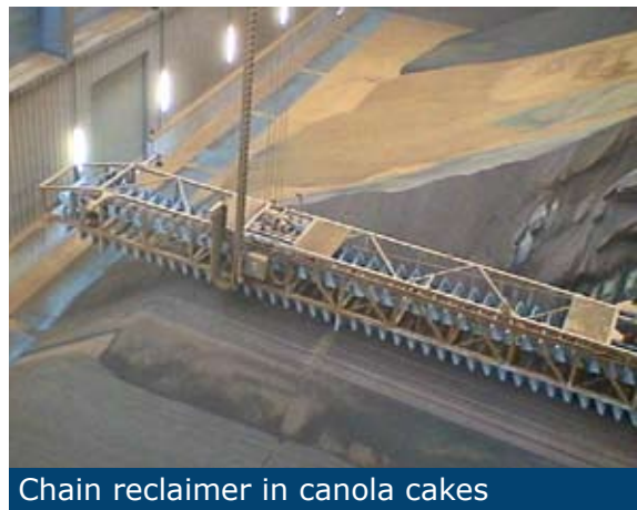
Chain reclaimer in canola cakes

Get more details on the web www.desmetballestra.com