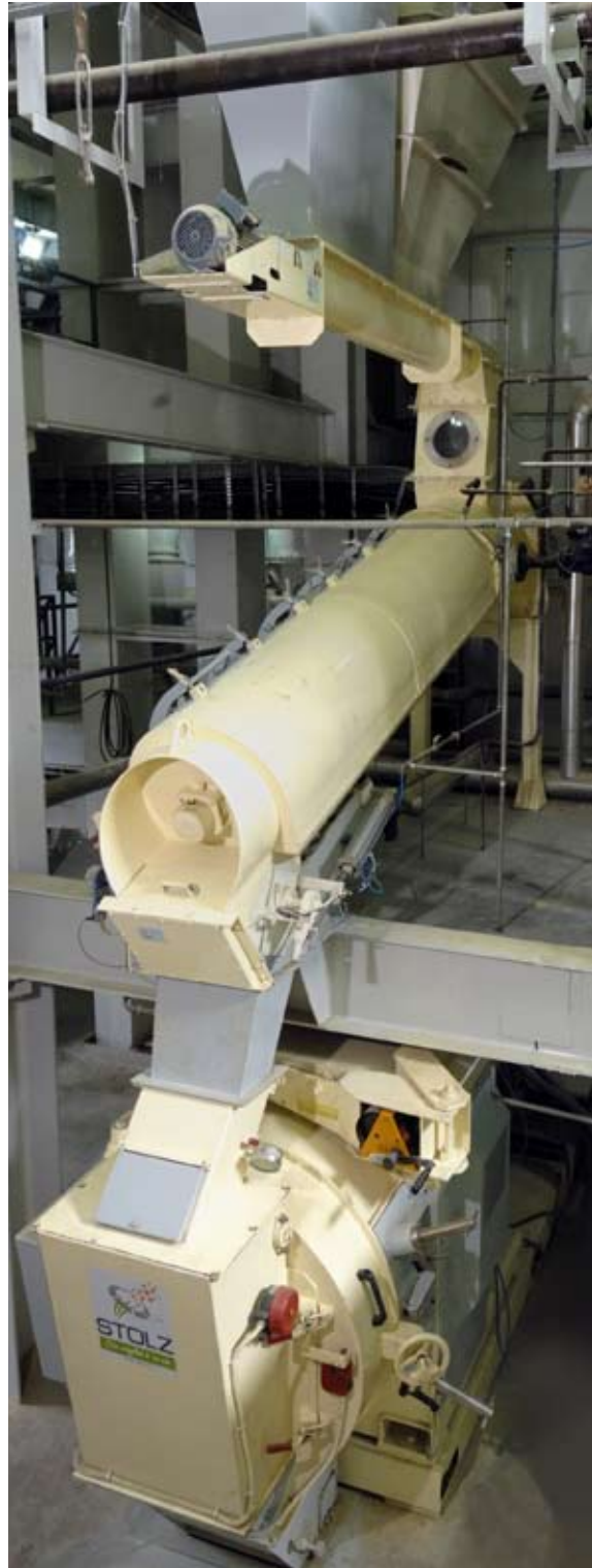
Super conditioner upstream a pellet mill

Get more details on the web www.desmetballestra.com