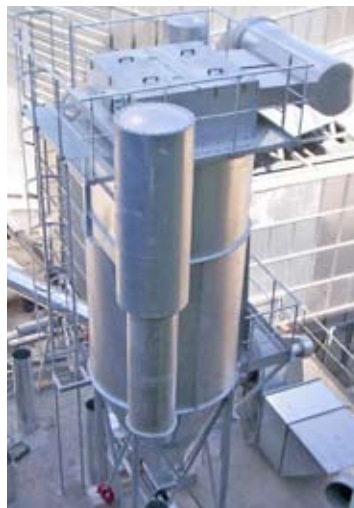
Galvanized cyclofilter with sleeves