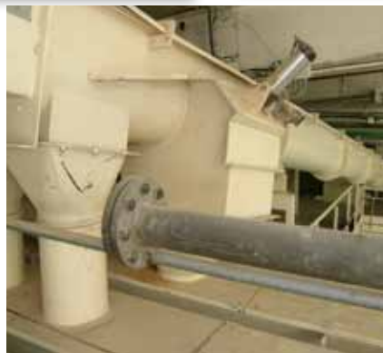
Valve with residues limitation