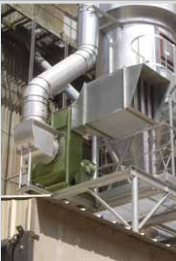
Galvanized cyclofilter with sleeves

The advantage of the cyclonic effect is a pre-separation of the biggest particles that could damage the sleeves.