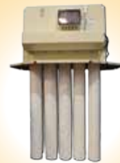
Sleeve filter unit for pneumatic transfer