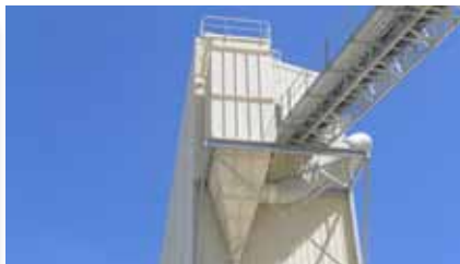
1400 m 2 sleeve filter