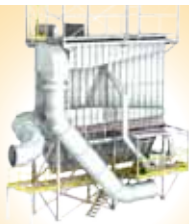
High capacity sleeve filter